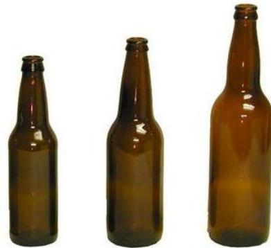
12 oz 16 oz 22 oz crown lip bottles