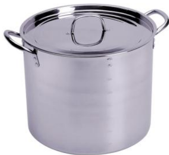
7 gallon stainless steel pot

You will need a large pot to boil your beer in. We recommend a 7 gallon stainless steel pot. You will also need bottles to put your masterpiece into. For your five gallon batch, we recommend twenty four 22 oz. bottles which are available at the store.